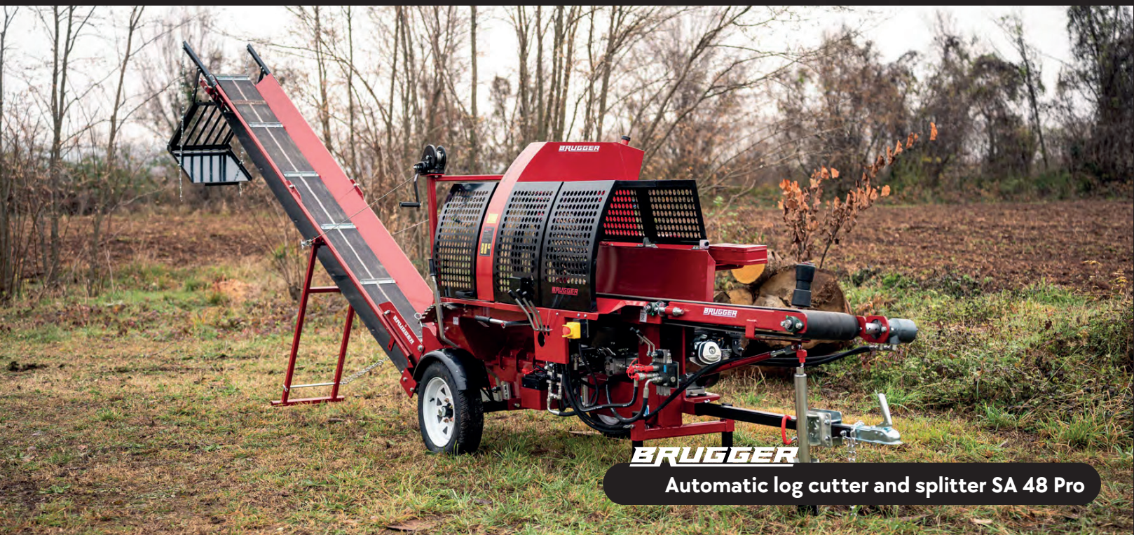
BRUGGER Automatic log cutter and splitter SA 48 Pro