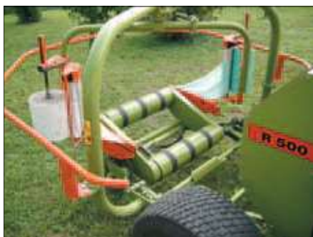
Hydraulic arm transferring the bale from the roundbaler to the wrapper.