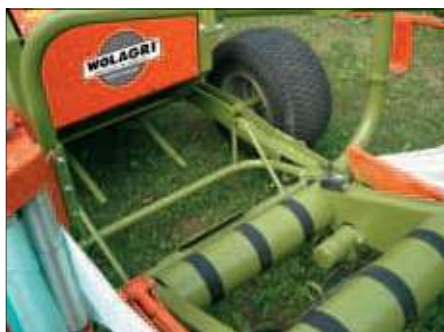
Wrapping system with 2 rotating arms and 2 stretchers ensuring a quick and effective wrapping. Film is cut by 2 hydraulic knives.